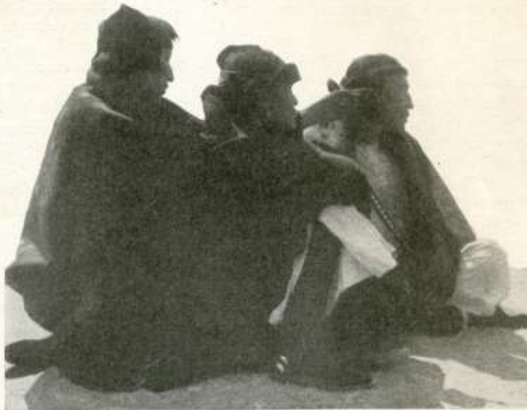
GROUP OF INDIANS.

Of equal importance in this work of preserving by something more than purely scientific methods the records of a vanishing race is the work of a small group of talented, and mostly young sculptors, who have been rising into prominence within the last few years. Very like some of Mr. Curtis' photographs, for example, was the small bust in greenish bronze by Adolph A. Weinman of "Chief Blackbird,"