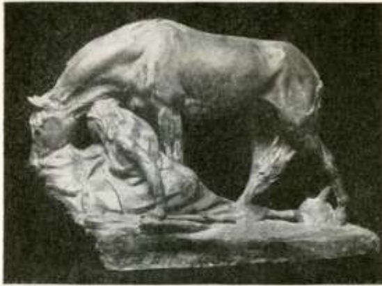
INDIAN AND HORSE. Solon H. Borglum, Sc.

nature and spirit of both—as may be seen in our reproductions. This resemblance was greatly increased in many cases by the warm tone of the photographs, and also by the discreet and subdued color given these prints by the process known as multiple photo-printing.