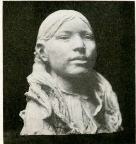
INDIAN BOY. A. A. Weinman, Sc.

titude, the atmosphere so to speak, that befits him. Notwithstanding the great difference in the methods of the two arts, the resemblance between these pictures and the works in bronze and plaster of the sculptors was striking, and testified to the faithfulness both to