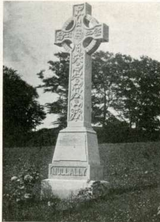
BEDFORD STONE CROSS, CALVARY CEMETERY, CLEVELAND.

It is a carefully executed, well-proportioned cross, and presents a fine appearance in the cemetery.