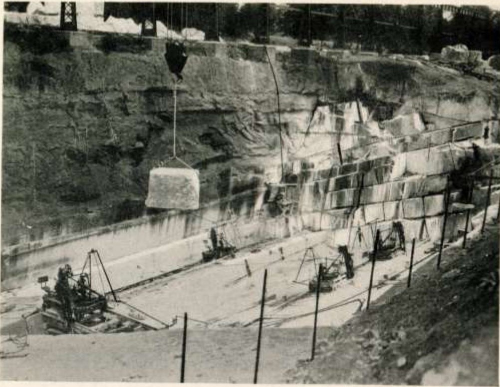
The Main Quarry Pit, Missisquoi Marble Co.