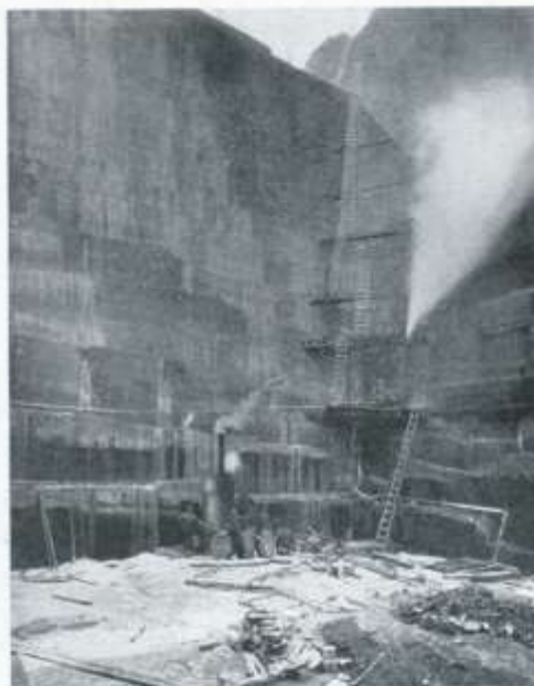
Channeled wall in a quarry.

The Missisquoi Marble Company owns a controlling interest in the Phillipsburg Railway, running from the quarry to Stanbridge, where it connects with the Central Vermont and with the Canadian Pacific System. A branch of the road links the property with its wharf on Lake Missisquoi, whence water communica-