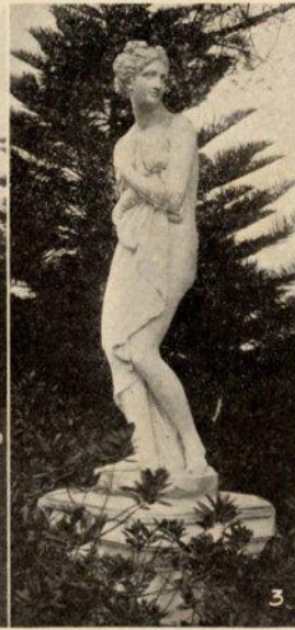
A Restored Venus. Golden Gate Park.

A statue of Robert Burns stands just south of the North Boulevard in Golden Gate park. It was modeled by M. Earl Cummings, of San Francisco. The bronze figure stands nine feet high, on a California granite pedestal, 6½ feet high and 4½ feet square.