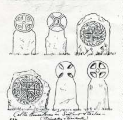
CELTIC HEADSTONES IN SCOTLAND AND WALES,

The evolution of the familiar Celtic Cross from the rude "pillar-stone" stage, is a very interesting hypothesis, and while it is not claimed by authorities that the changes took place in chronological order, it may be helpful to briefly consider it. The so-called pillar-stone was not given any regular architectural shape, the earlier examples being crudely decorated with a simple incised cross on both the front